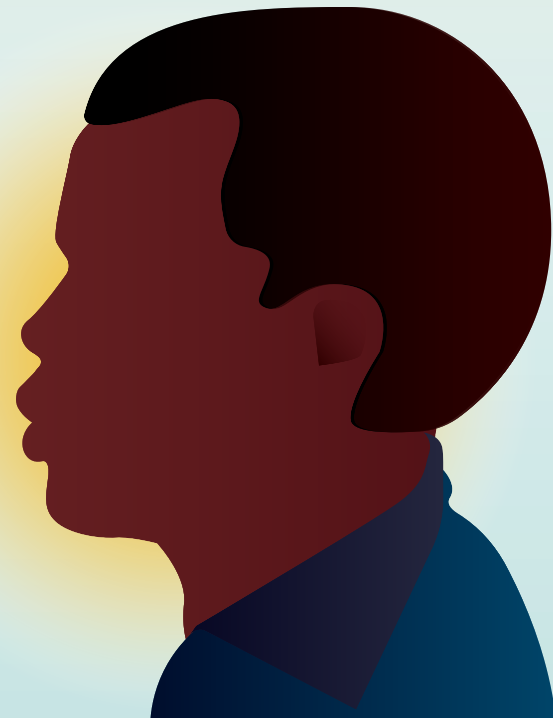
CHINUA ACHEBE 1930–2013

The Nigerian-born author is widely seen as the father of modern African literature. His first novel, the insightful social commentary Things Fall Apart , has been translated into more than 50 languages. Nelson Mandela said Achebe "brought Africa to the rest of the world."